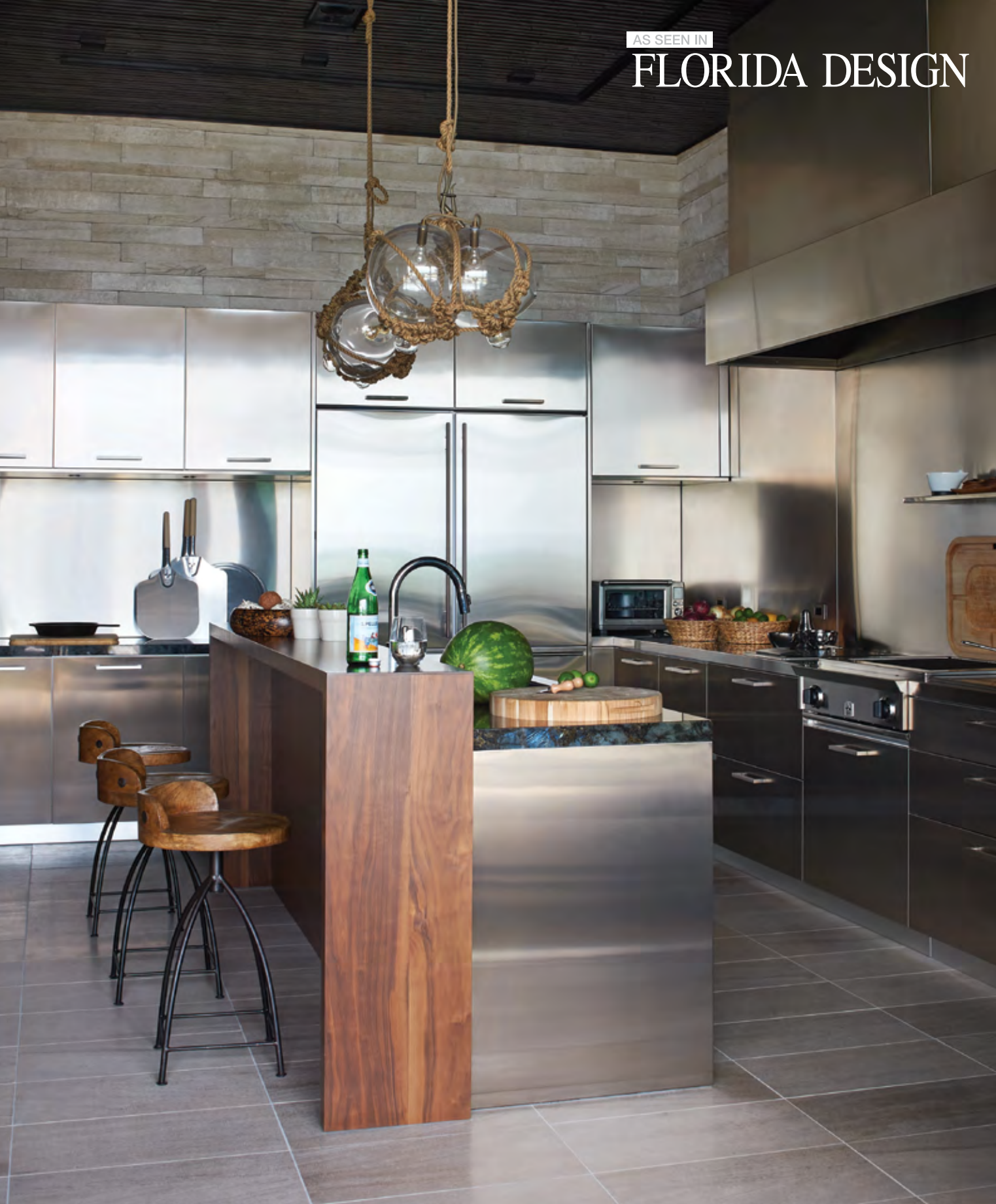
ABOVE: With the kitchen's hard stainless steel cabinetry by Italy's Rifra, and the raw Alabama rusticated limestone walls and flooring, the walnut stools from Arteriors feel human and warm. Lindsey Adelman's "Knotty Bubbles" pendant in clear glass and khaki rope gives a nod to the sea.

A branching bubble light fixture hangs above a teak slab table in the breakfast area. Between the casual dining and family areas, a striking interior fire pit, custom designed by Junkin and architect Erik Helgen, pulls activities together in the way that campfires often do.