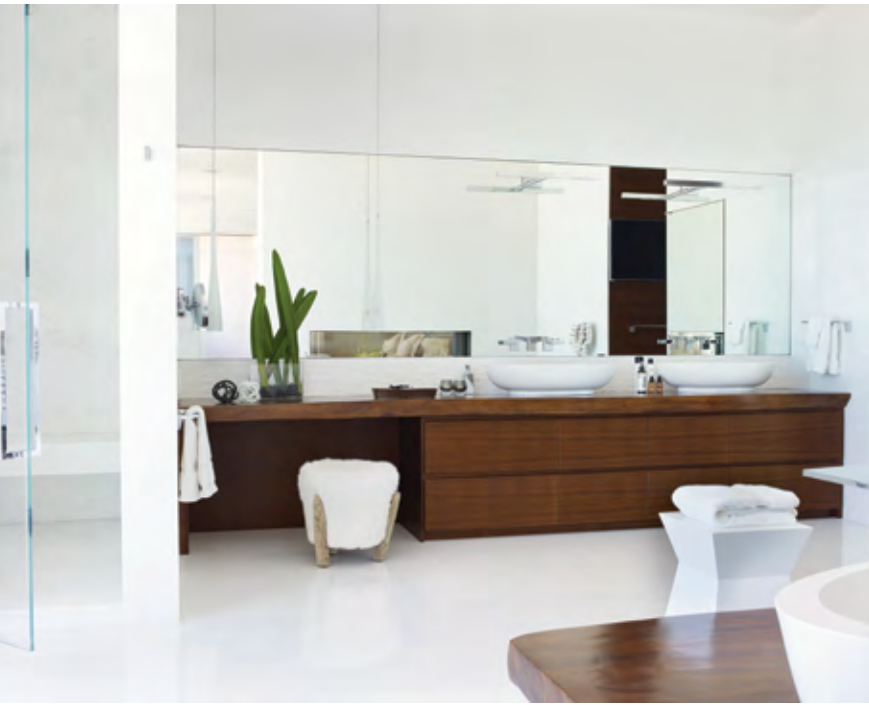
With the simplicity of a spa, the master bath's linear see-through fireplace and a simple shell necklace on a stand suggests a world of exotica ... something to contemplate while reclining in the shell-shaped Rifra tub.